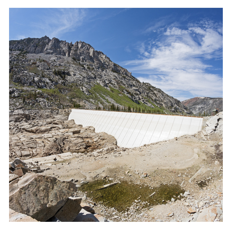
The South Lake Dam in California's Sierra Nevadas shows signs of drought conditions affecting many states in the west.

For urban water users, the sting of drought in past decades has been softened by water storage and water providers who have proactively planned to ensure reliable supplies. The severity of the multiyear drought in California removed that cushion for some, such as citizens of