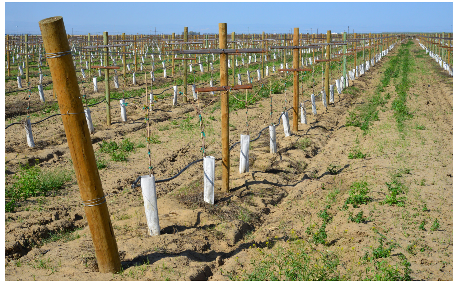
Some farmers use drip irrigation to apply water efficiently, close to the plant root zone. Agricultural water conservation achieved by drip irrigation helps farmers save water, but implementation of drip should account for local hydrological conditions.

Las Vegas and Los Angeles—are encouraging residents to reduce water use by offering rebates for turf removal in favor of less-thirsty landscaping. Utilities are also showing customers how much water they use in comparison to their neighbors through easy-to-interpret graphical information on bills and smart phone apps.