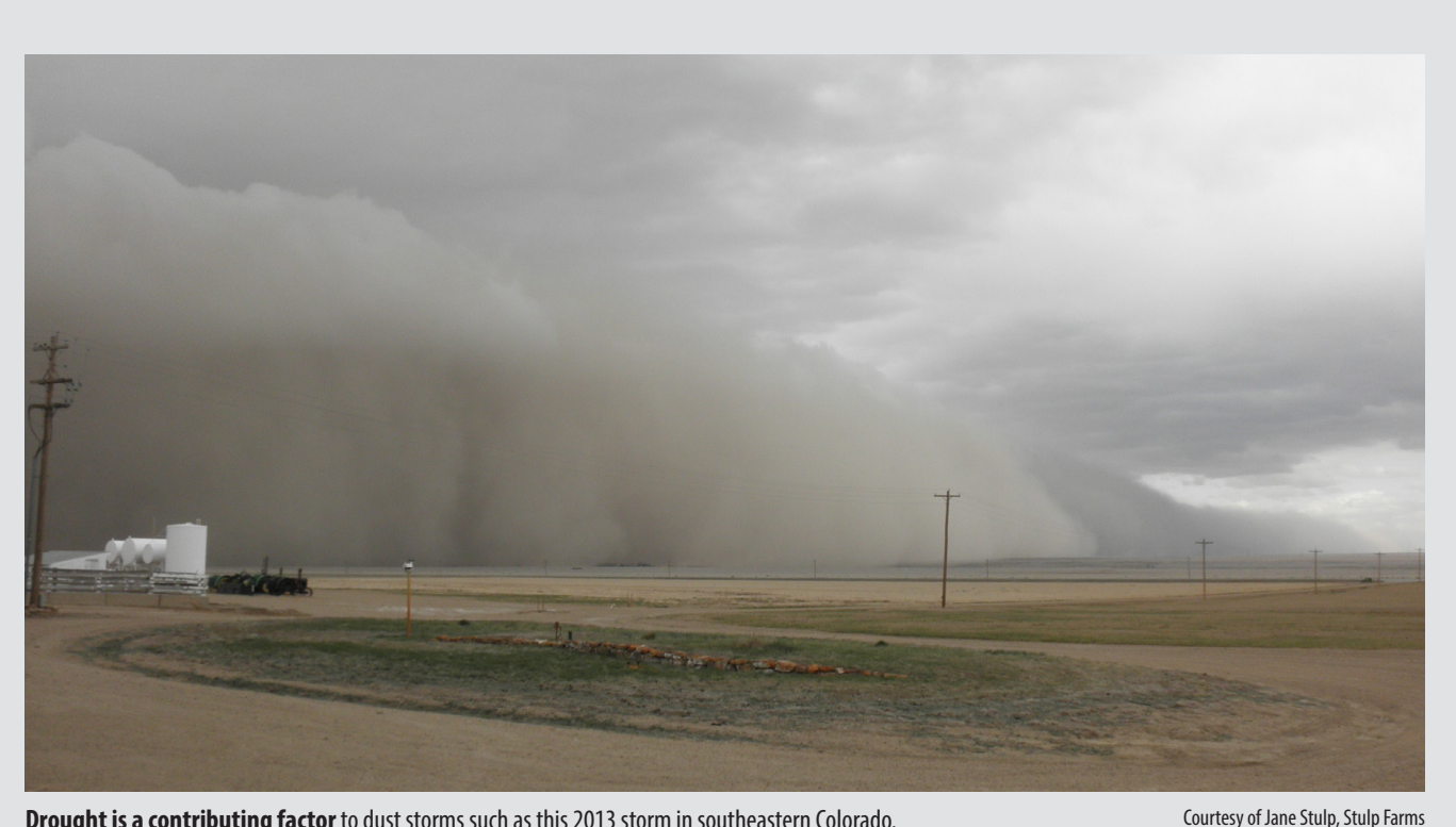
Drought is a contributing factor to dust storms such as this 2013 storm in southeastern Colorado.