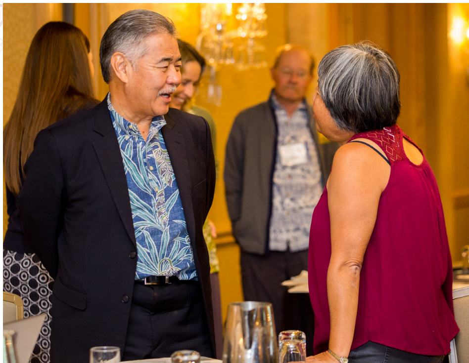
Hawai'i Gov. David Ige described his state's battle against invasive species as not only the "right thing" to do but work that makes "economic sense."

Identify and expand use of Good Neighbor Authority. Good Neighbor Authority (GNA) allows states to enter into cooperative agreements with certain