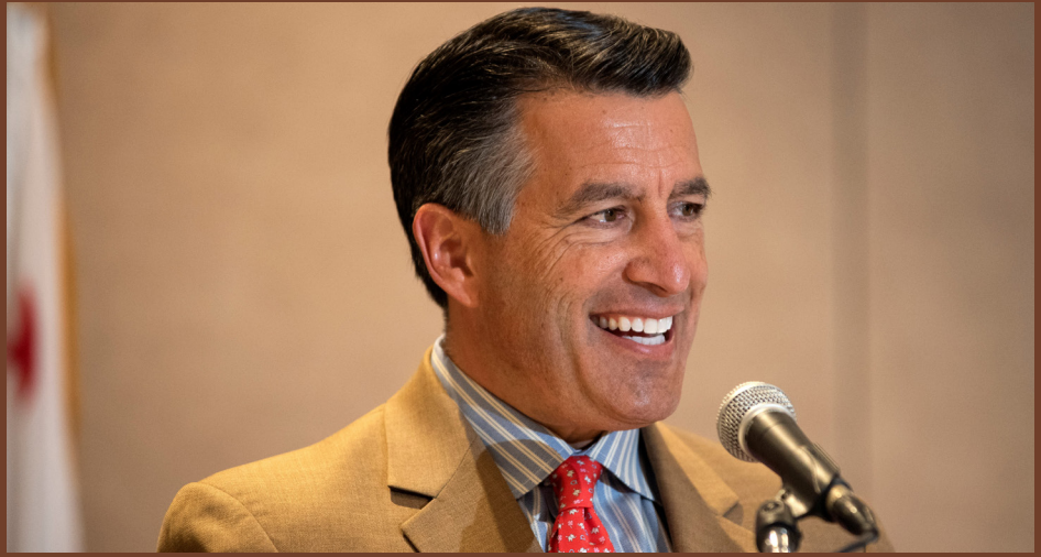
Nevada Gov. Brian Sandoval noted in his keynote that invasive species “can interrupt the very social fabric of the West.”

spoke and highlighted how “Western Governors are using their convening power and energy to confront the scourge of invasive species. The impacts of invasive species in the West are as pervasive as they are underreported.”