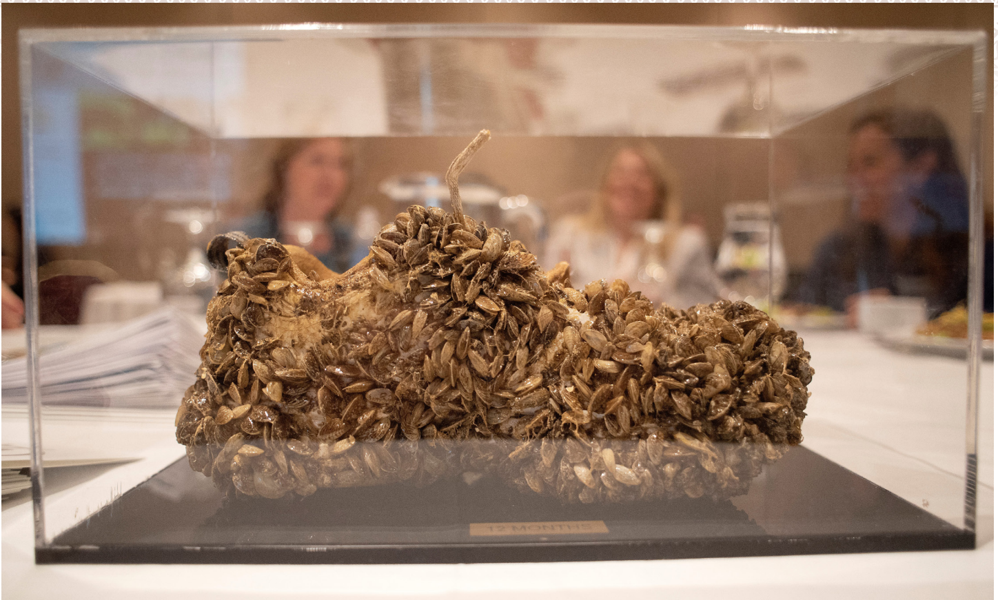
A shoe encrusted with invasive mussels vividly illustrates the impact of the rapidly spreading invasive species.

Since it first emerged in the U.S. in 1999, West Nile virus has infected at least 17,737 people and caused 1,654 deaths. 9 Chronic wasting disease, an emerging infectious disease that is fatal to free-ranging and captive deer and elk, has been discovered in 24 states and continues to spread. 10 In Hawai'i, invasive fungal pathogens are resulting in Rapid 'Ōhi'a Death, a vast die-off of endemic 'Ōhi'a trees that are crucial to Hawai'i's ecosystems and culture. The emerald ash borer has killed hundreds of millions of ash trees in North America and has caused lasting damage to native and urban forests since 2002. 11 In Guam, the coconut rhinoceros beetle caused the native fadang tree, once the most abundant tree in Guam's forest, to be placed on the endangered species list in 2015. 12 The beetle was detected in Hawai'i in 2013 in the area around Pearl Harbor and has been contained to that area thus far. The beetle is now threatening the native coconut palm, a tree central to the environment, economy, and culture of Guam, Hawai'i and other Pacific Islands.