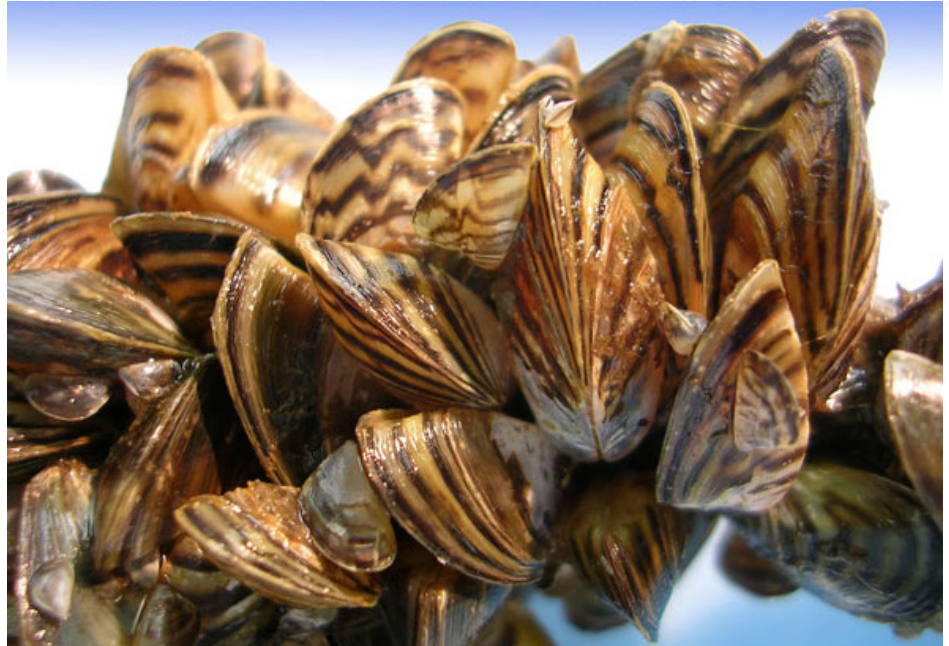
Zebra Mussels.

The state also developed the Regional WID Data Sharing System, now the main method of communication among inspection stations and managers. The system is now performing watercraft inspection and decontamination in 10 western states, as well as for numerous local governments, national parks, and private industry. It consists of a mobile application for field personnel, a website for managers and a shared database. The system, which sends out real time alerts when infested watercraft are moving into uninfested waters, has directly resulted in more interceptions preventing new invasions.