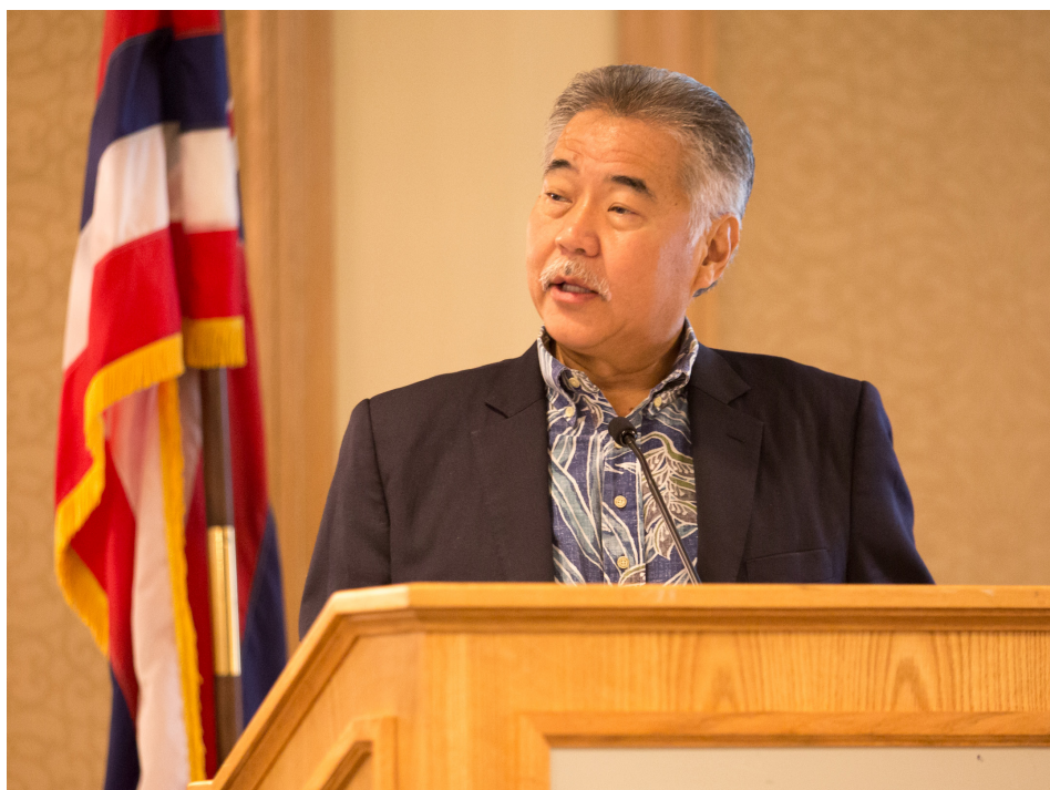
Hawai'i Governor David Ige launched the Biosecurity and Invasive Species Initiative as his central policy effort as WGA Chair.

This report presents the findings of the Initiative and recommends actions Governors can take to achieve the following goals: