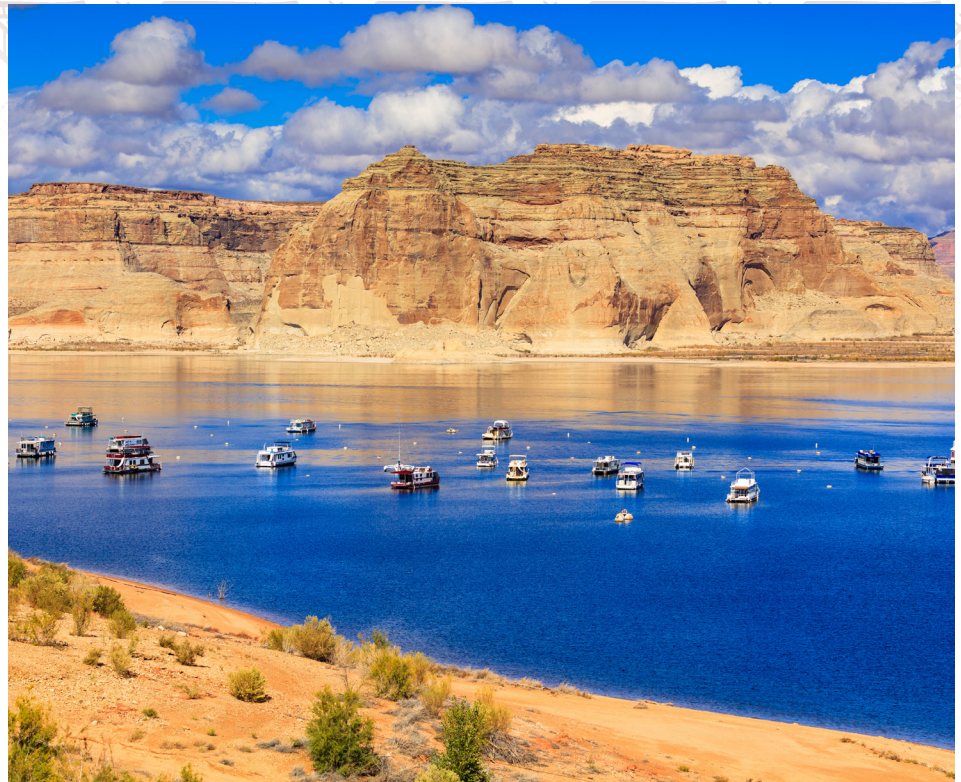
The Utah Division of Wildlife Resources is working with the Arizona Game and Fish Department and the National Park Service at Lake Powell.

The changes quickly resulted in improved inspections and decontaminations, a significant decrease in the number of boats found with mussels aboard upon subsequent inspections, and spawned a partnership between UDWR, the Bureau of Reclamation, and the National Park Service to conduct research studies examining the viability of both larval and adult mussels passing through different types of ballast pumps. Study results indicated that adult mussels can easily survive passage through ballast pumps, spurring further research studies and critical analysis of current decontamination protocols.