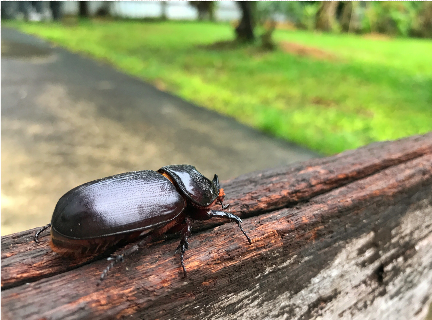
Coconut Rhinoceros Beetle.